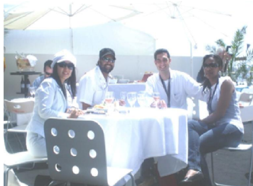
FMA-07 Participants at Canadian Luncheon hosted by Kodak